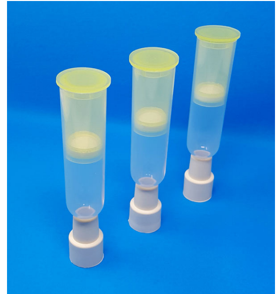
Purified Plasmid Yield