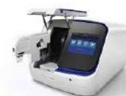
SeqStudio Genetic Analyzer

Bring sanger sequencing & fragment analysis in-house with the SeqStudio Genetic Analyzer. Contact us to learn more.